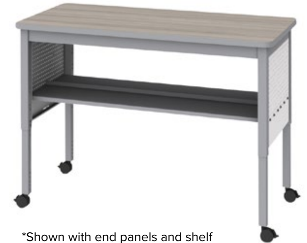
*Shown with end panels and shelf

Pick the top that best suits your needs: durable, hard-wearing high pressure laminate with a variety of colorful edge band options, or chemical-resistant epoxy for more specialized maker space projects. Fully-welded steel frame can be enhanced with pegboard end panels and heavy duty shelves.