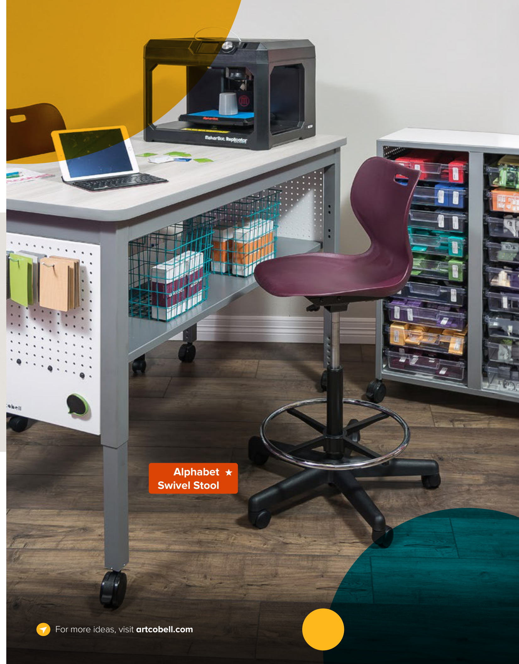
Alphabet ★ Swivel Stool

The refined design of Alphabet Seating supports the many ways that students move with best-in-class strength and durability. The Alphabet Stool features swivel and pneumatic height adjustment with a five-star base. Stool seat heights range from 22"-32".