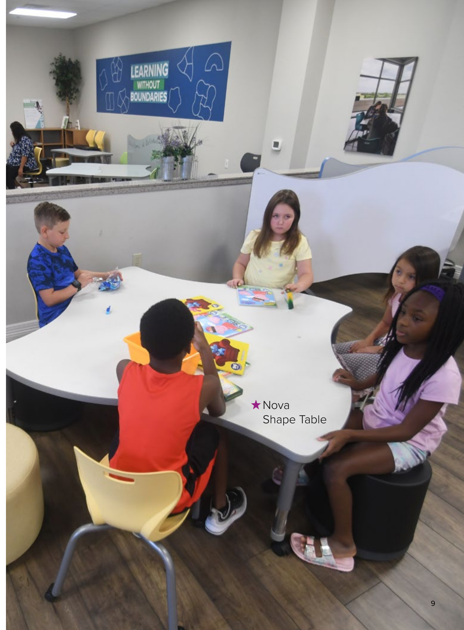
★ Nova Shape Table