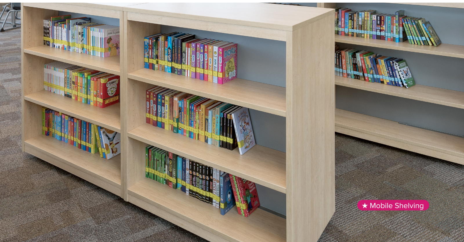
★ Mobile Shelving