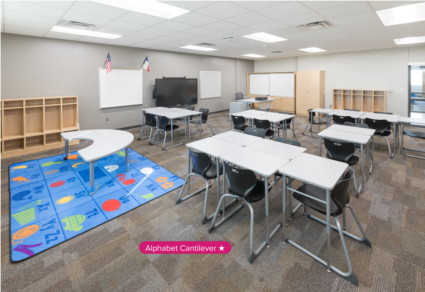
★ Alphabet Cantilever ★