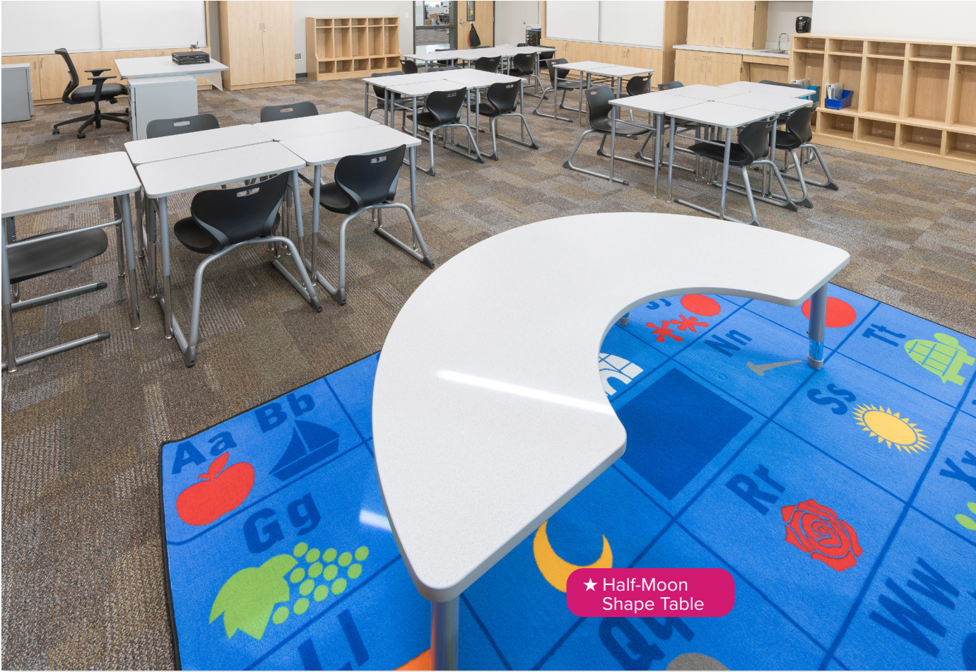
★ Half-Moon Shape Table