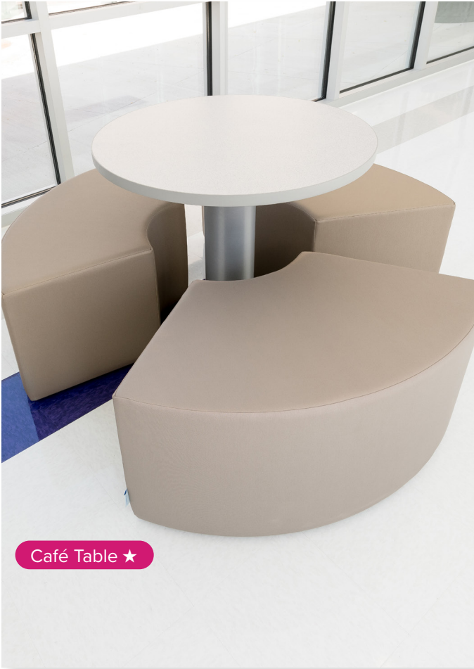
Café Table ★