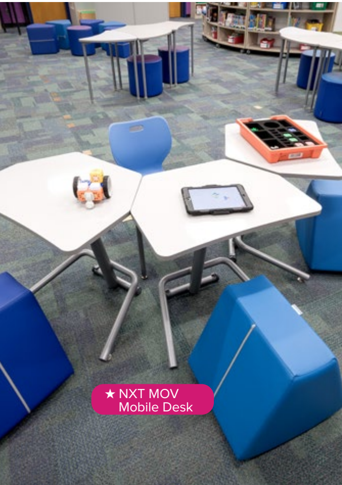
★ NXT MOV Mobile Desk