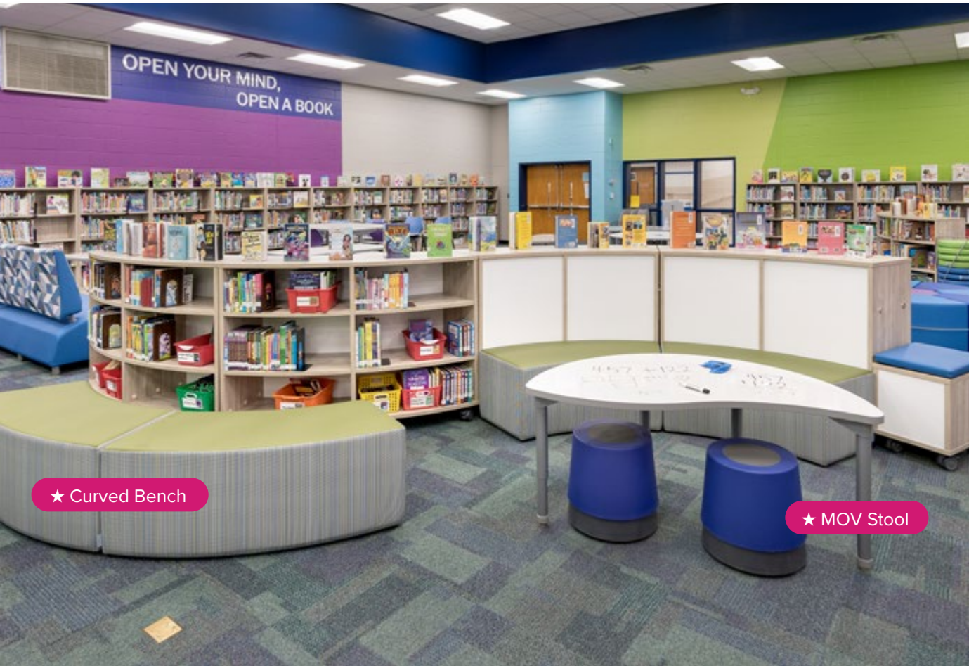
★ Curved Bench