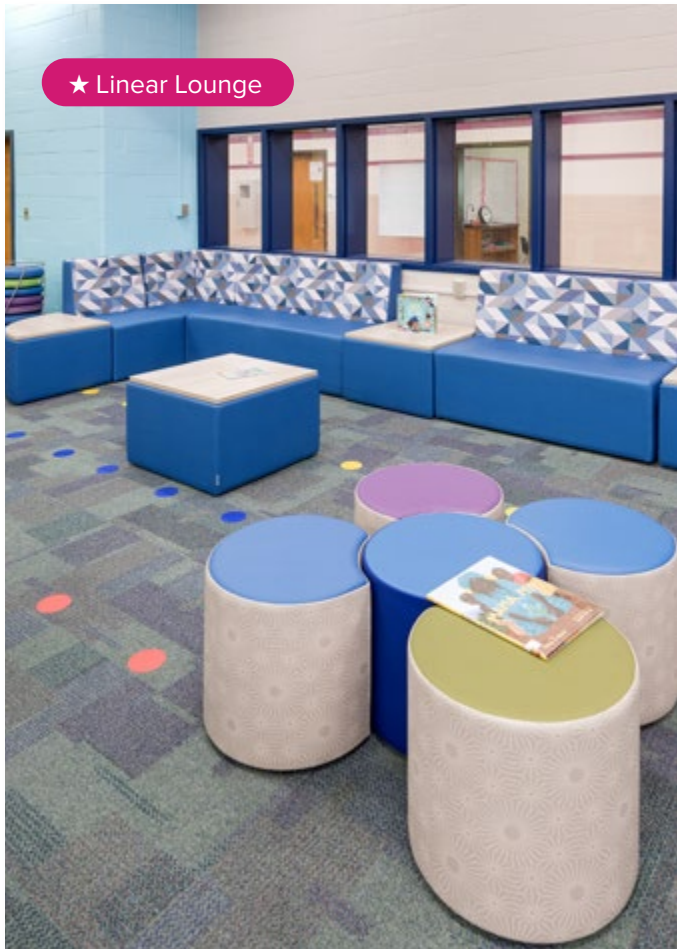
★ Linear Lounge