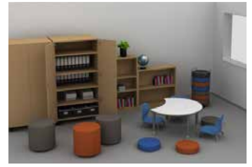
Easy Access for Supplies