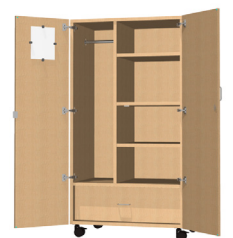
Wardrobe with File