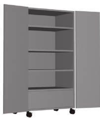
Shelves with File